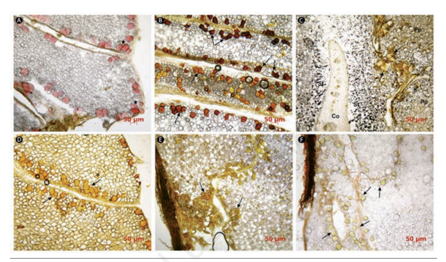
Figure 1. Endosperm sections after twelve days of germination. A) Kedde's reagent; pink/magenta-coloured drops indicate acetogenins (marked with the asterisks). B,C) Lugol's reagent; golden/brown-coloured drops indicate alkaloids, dark blue-coloured granules indicate starch. D) Dragendorff's reagent; gold/orange-coloured drops indicate alkaloids. E) Dittmar's reagent; golden/brown-coloured drops indicate alkaloids. F) Ellram's reagent; olive coloured drops indicate alkaloids. Arrows, alkaloid drops; St, starch granules; Pp, proteoplasts; Co, cotyledons.

The positive reactions to Kedde's reagent and the alkaloid reagents were localised in the idioblasts of the endosperm, as well as in the hypocotyl and the radicle, which have conse-